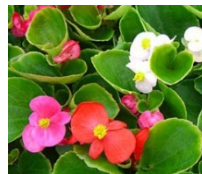
Green Leaf Begonia