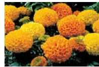
Marigold (large head)