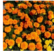
Marigold (small head)